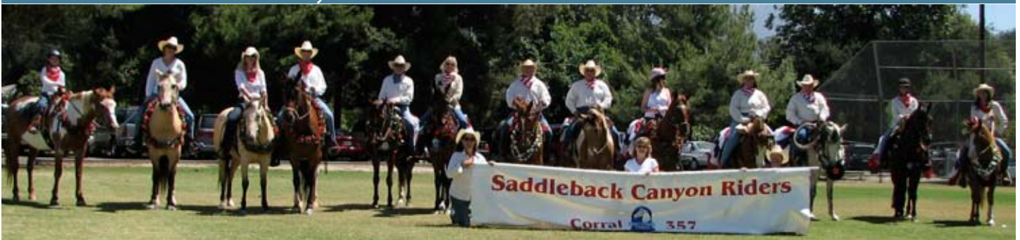
ETI 357 at the school after the July 4th Parade