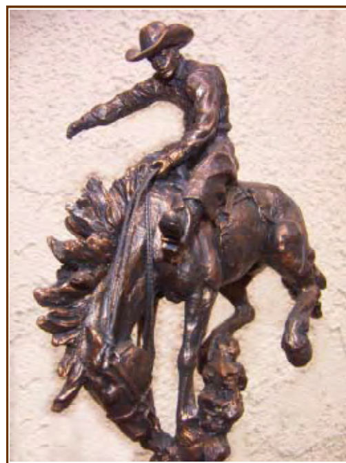
"The Ride that Became the PRCA 50 th Wrangler National Finals Rodeo 1958-2008"